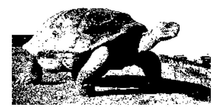
Giant Tortoise, Charles Darwin Research Center, Santa Cruz Island, Galapagos Islands, Ecuador