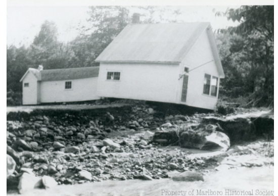
Bottom image shows Branch School after the 1938 flood.